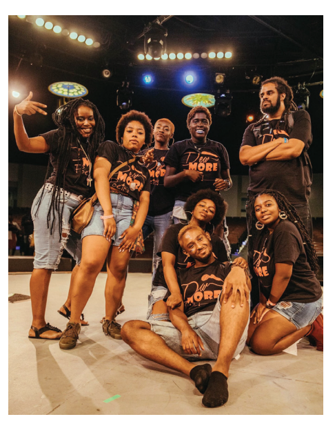
DewMore Baltimore Youth Poetry Team aka BCYPT are featured performers at the 7th Biennial Trauma Conference, Center for Child and Family Traumatic Stress.