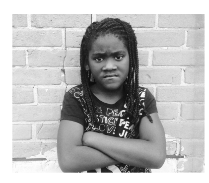
What is the effectiveness of integrated DBT-C and TF-CBT intervention for children with traumatic stress symptoms and disruptive behavior?

Perepletchikova and colleagues, below). DBT-C was also associated with lower rates of treatment drop-out, higher rates of treatment attendance, and enhanced parent and child treatment satisfaction. The children in the published study, however, were from middle to high socioeconomic backgrounds and did not have significant trauma histories.