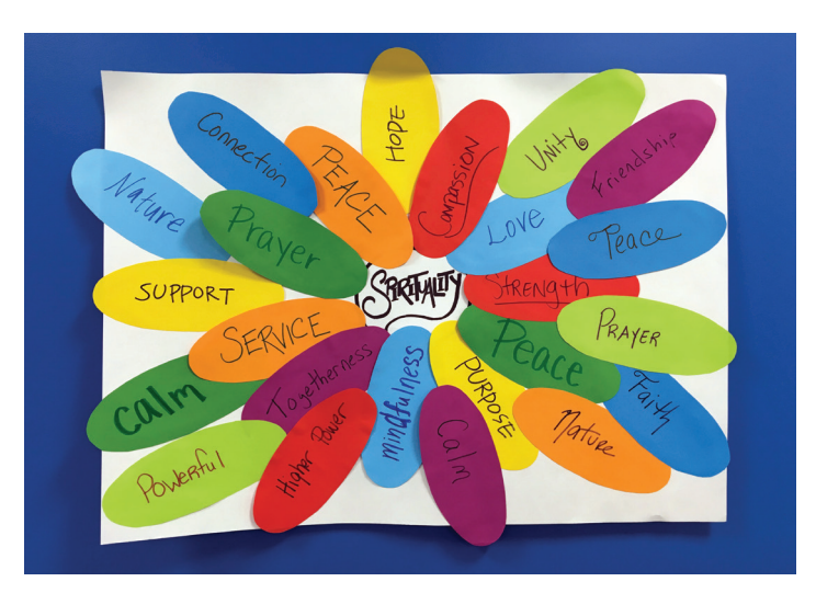
A "spirituality word flower" allows families in SFCR to identify and share words connected to their ideas about spirituality as a source of strength and resilience. Visit https://www.sfcresources.org/ for more on SFCR.

We brought SFCR to the Traumatic Stress Center in 2010 in an effort to help families who appeared "stuck" in other treatment models. Although these families were seeking to create change, they continued to experience ongoing stress, such as exposure to community violence and housing instability. Thus far, we have offered 23 rounds of SFCR (18 in English and 5 in Spanish) with more than 120 families. Our team is repeatedly reminded of the power of this group to not only bring individual families closer, but to help families create support networks with one another.