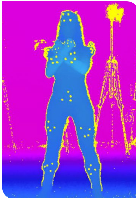
On the left, a CNIR staff member demonstrates the center's imitation dance task while wearing motion tracker markers. The staff member's corresponding Xbox Kinect image is on the right.